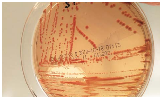
Figure 2 | Rhizobium radiobacter culture in MacConkey agar

R. radiobacter (formerly Agrobacterium radiobacter ), is a gram-negative bacillus of rapid growth in common media like MacConkey agar, where they appear as round, bright and orange, non-haemolytic colonies on blood agar, glucose non-fermenter, aerobic, mobile, urease and positive oxidase 1 (figure 2).